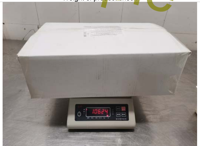
Gross weight of carton check