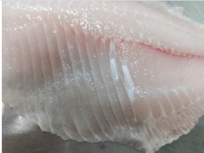
Pic.7: Skin residual-Minor