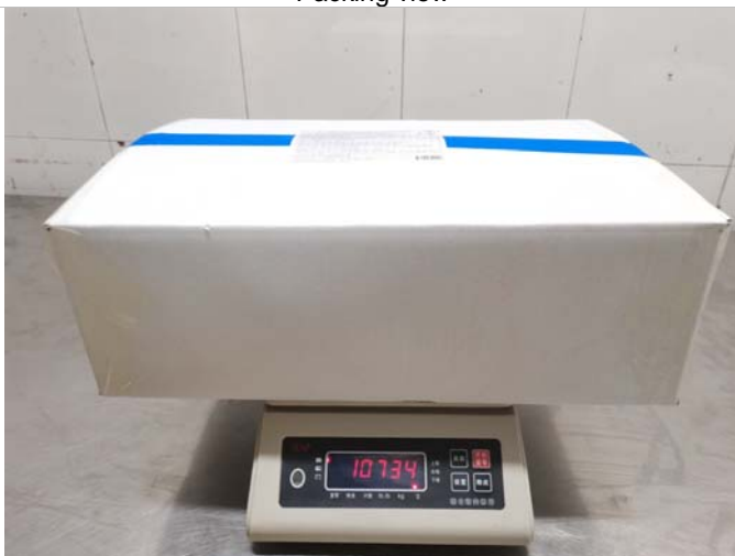
Gross weight of carton check