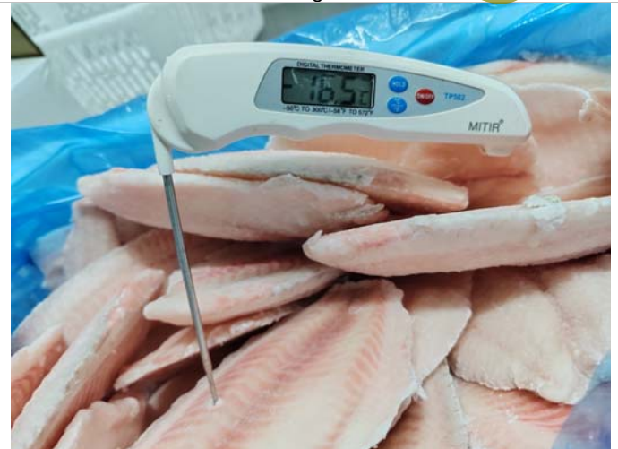
Temperature of product check