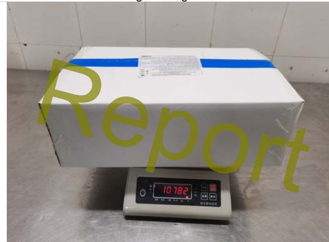
Gross weight of carton check