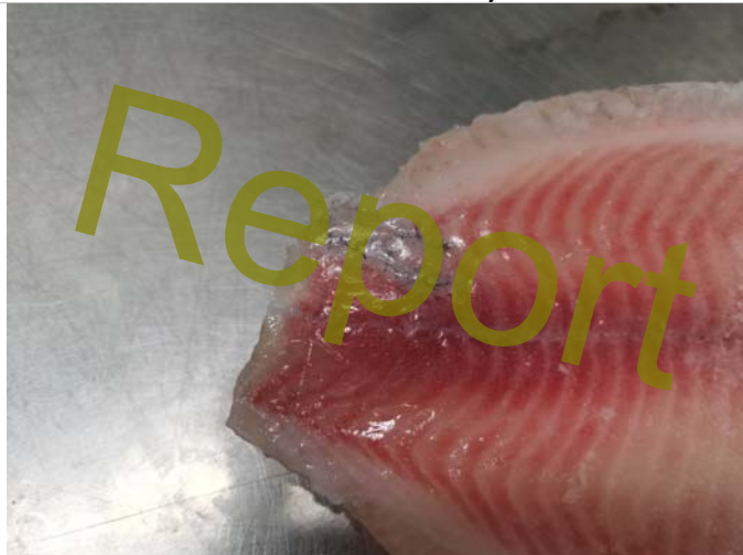
Pic.3: Skin residual-Minor