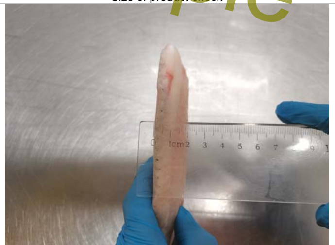
Size of product check