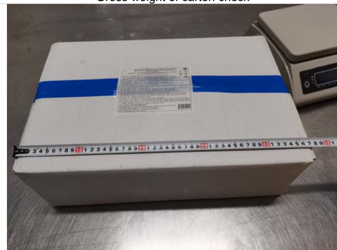
Size of carton check