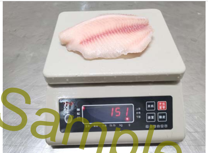
Weight of Defrost block (without ice) check