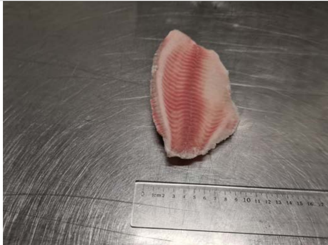
Size of product check