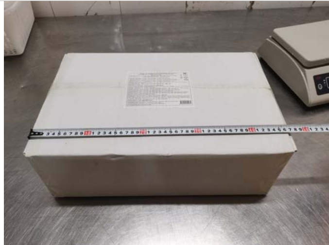
Size of carton check