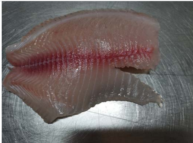
Pic.5: Broken fillet-Major