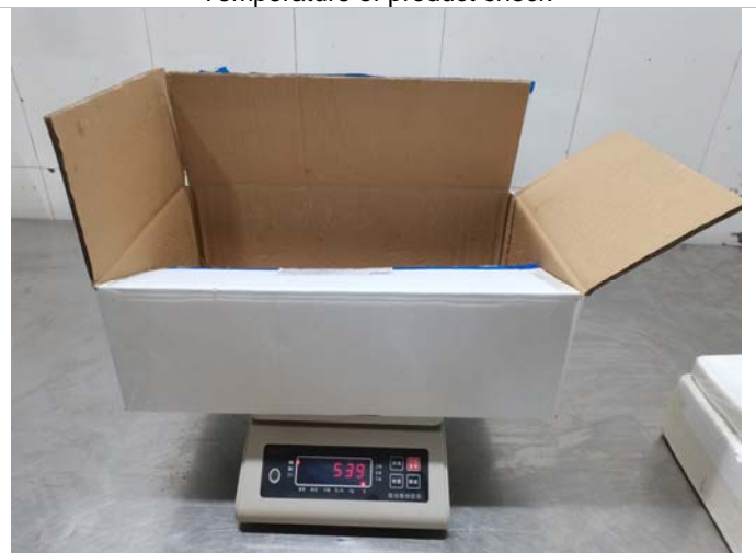
Weight of empty carton check