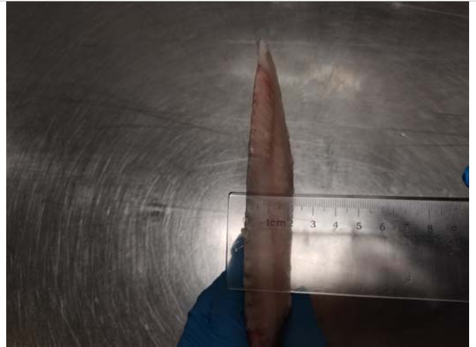
Size of product check