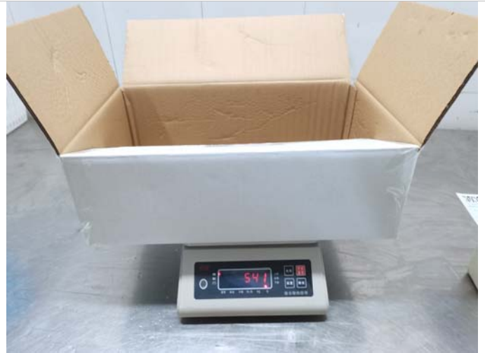
Weight of empty carton check