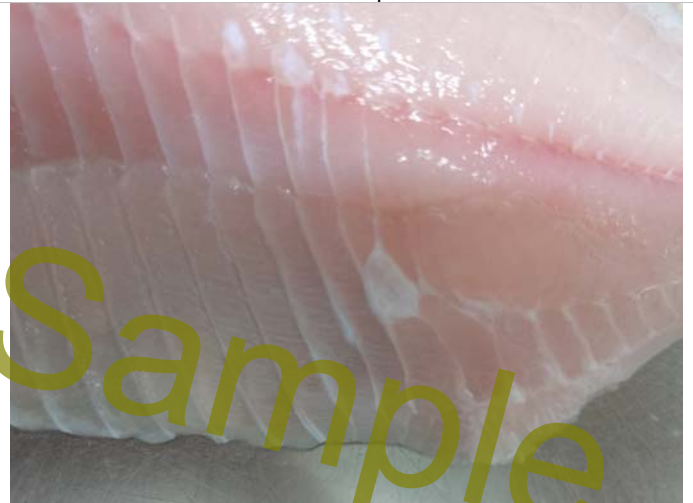
Pic.4: Skin residual-Minor