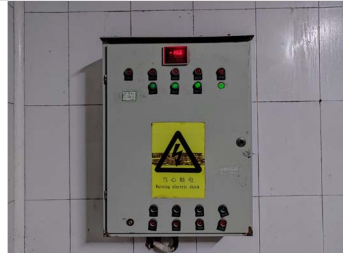
Temperature of storage -19.5°C