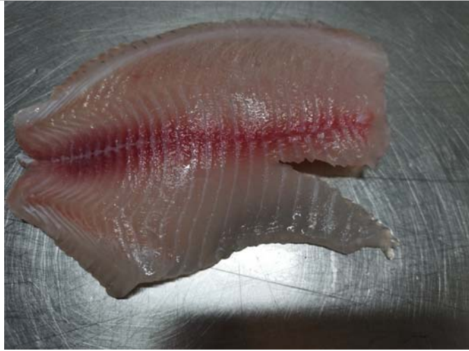
Pic.1: Broken fillet-Major