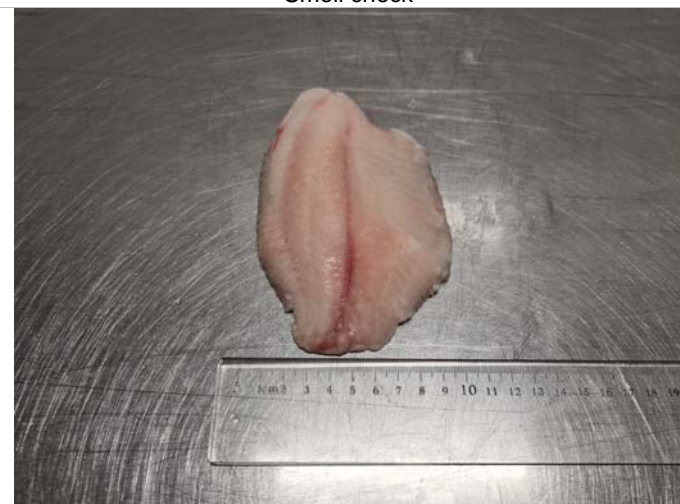
Size of product check