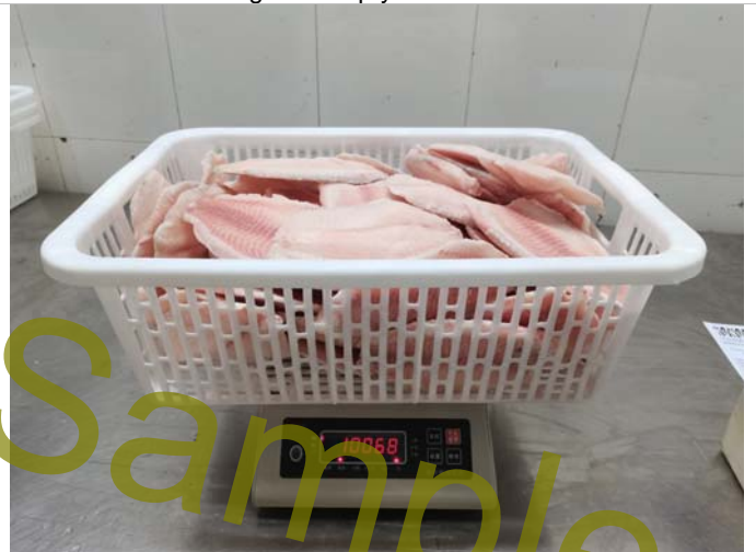
Weight of product check