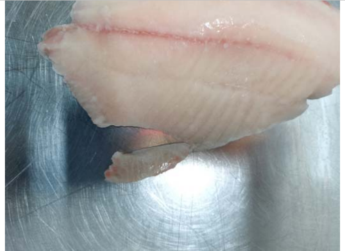
Pic.2: Bad shape-Minor