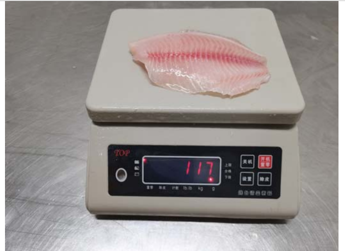
Weight of Defrost block (without ice) check