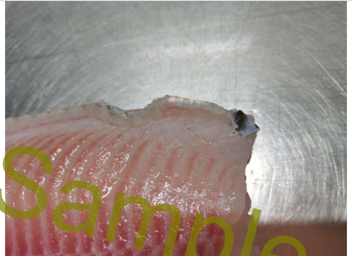
Pic.10: Skin residual-Minor