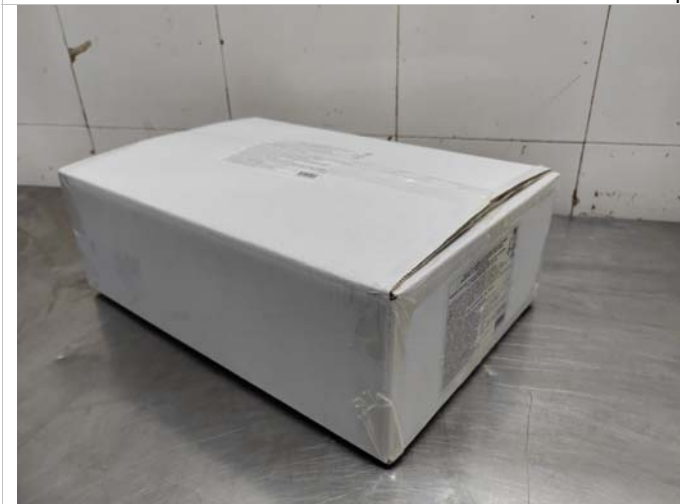
Frozen Tilapia Fillets 5-7oz

Storage condition: before and after opening the package keep at -18°C and below После размораживания повторно не замораживать / Double freezing is not allowed Наименование и адрес изготовителя/Name and address of manufacturer: Hainan Qinfu Foods Co.,Ltd. No.320, Wengqing Road, Qionglan New Urban, Wengling City, Hainan Province, China / Хайнань Кинфу Фудс Ко., Лтд. No.320, Венцинг Роад, Кюньлан Нью Урбан, Вэнцзинг Сити, провинция Хайнань, Китай Номер завода изготовителя / Producer plant number: 4600/0209 Импортёр и организация по прoдукции претензий/ Importer and organization handling organization claims ООО «Продуктовая метизация/LLC «Produktovaya metizatsiya», 443022, Россия, Самарская область, г. Самара, Заводское шоссе, дом 20, тел.: +7 927 789 16 05 ИНН 6319152954 / 443022, Russia, Samara region, Zavodskoye shosse, 20 TIN 6319152954 Номер партии / Lot No.: 2403250233Y02 Ионизирующее излучение не использовалось / Ionizing radiation was not used ПРОИЗВЕДЕНО В КИТАЕ / PRODUCT OF CHINA Рекомендуется употребить после кулинарной обработки / It is recommended to use after cooking