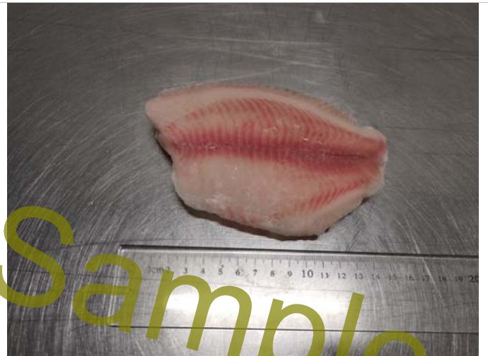
Size of product check