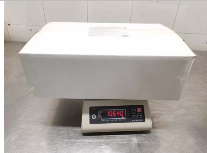
Gross weight of carton check