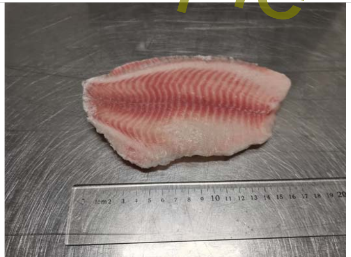
Size of product check