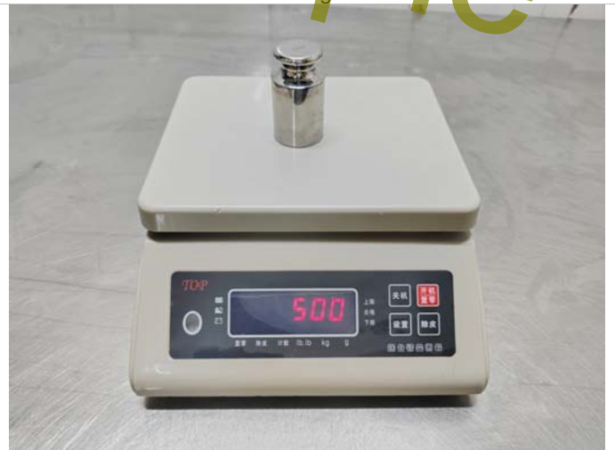
Electronic balance check