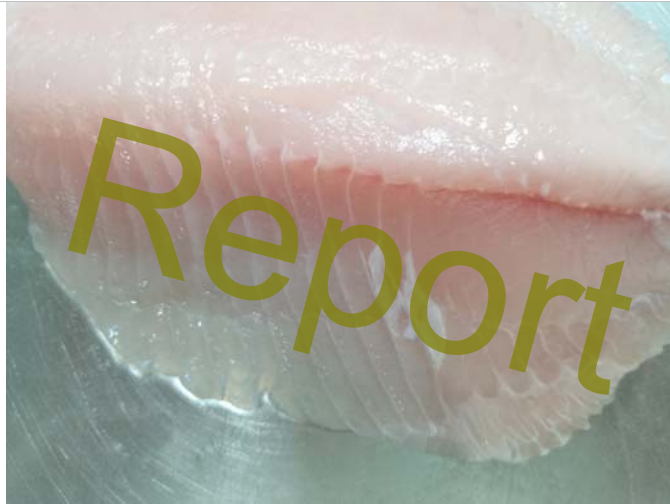
Pic.9: Skin residual-Minor