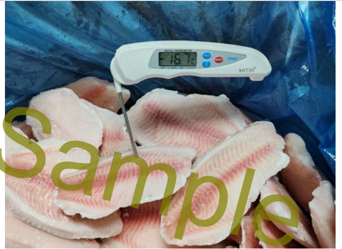
Temperature of product check