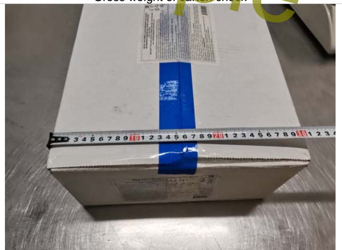
Size of carton check