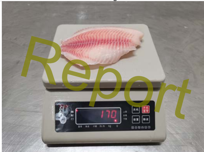
Weight of Defrost block (without ice) check