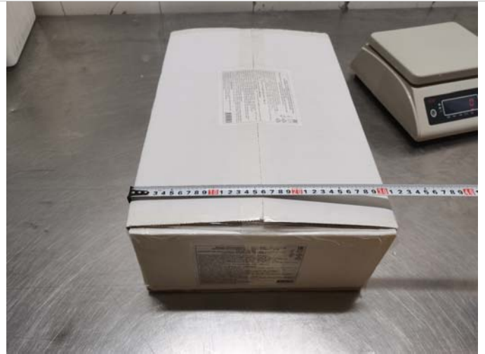
Size of carton check