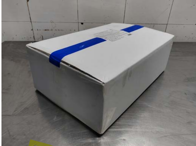
Frozen Tilapia Fillets 3-5oz