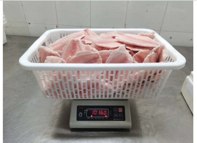
Weight of product check