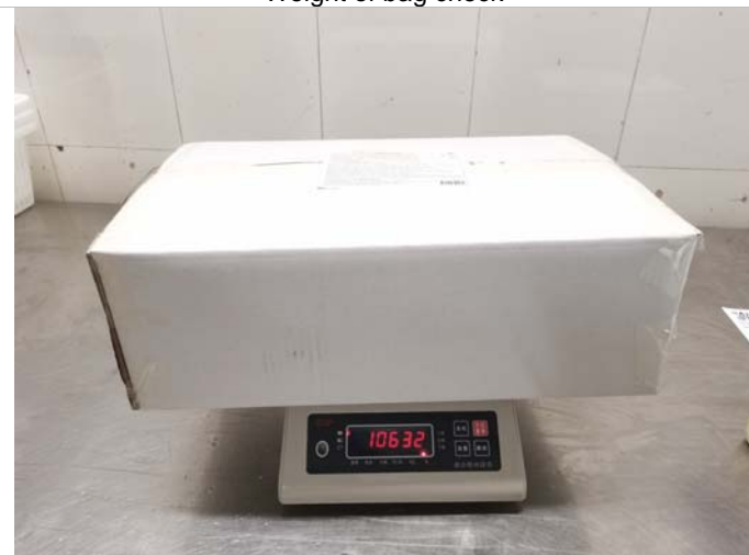
Gross weight of carton check