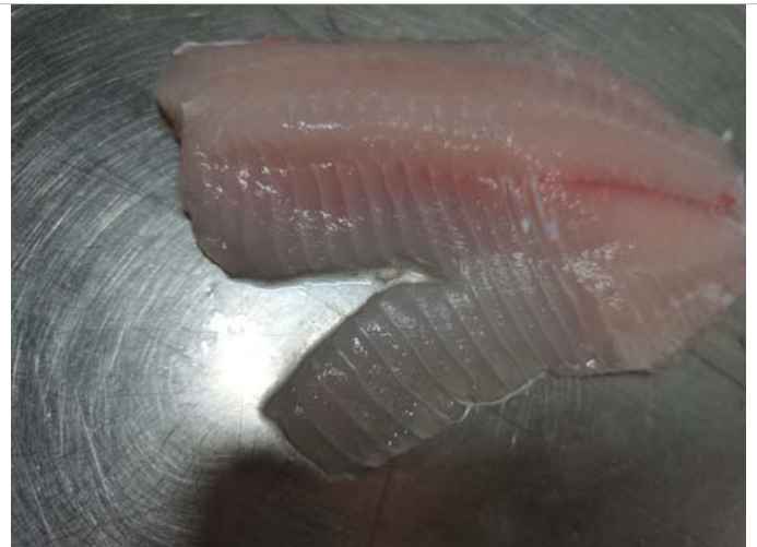
Pic.6: Broken fillet-Major