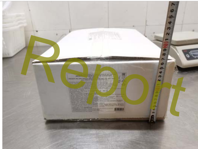
Size of carton check