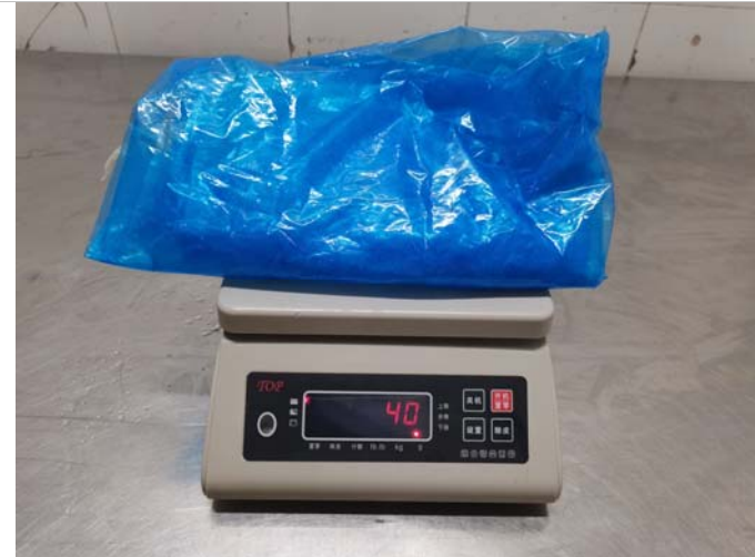
Weight of bag check