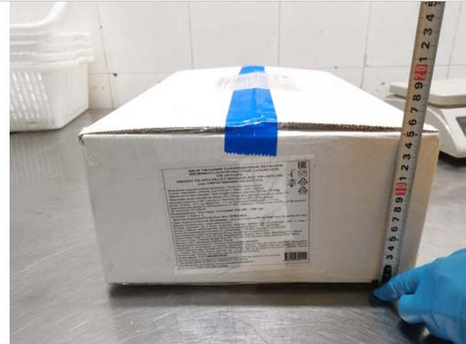
Size of carton check