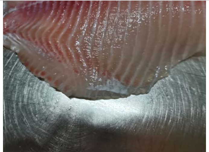
Pic.8: Skin residual-Minor