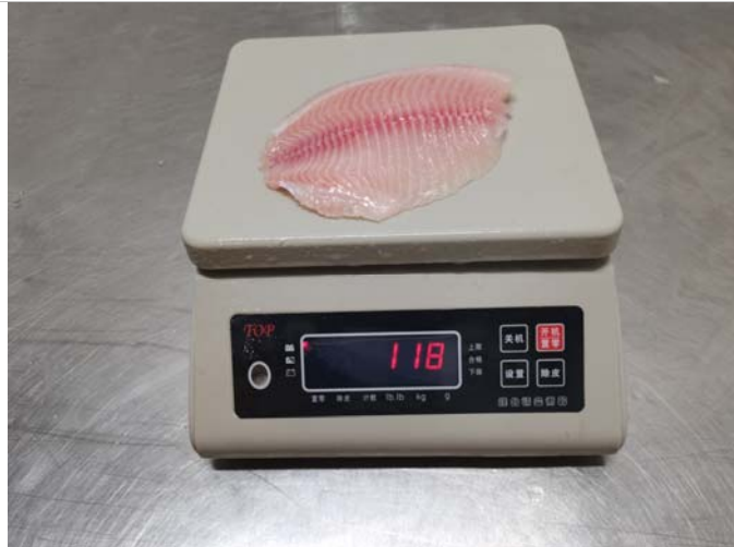
Weight of Defrost block (without ice) check