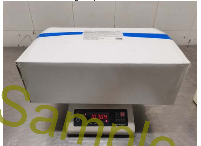
Gross weight of carton check