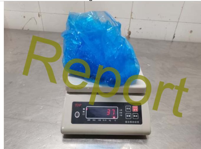
Weight of bag check